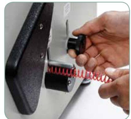
Change from size to size with the innovative diameter adjustment guide