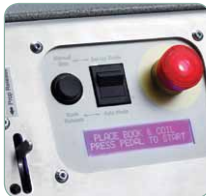
LCD Screen communicates machine status at all times.